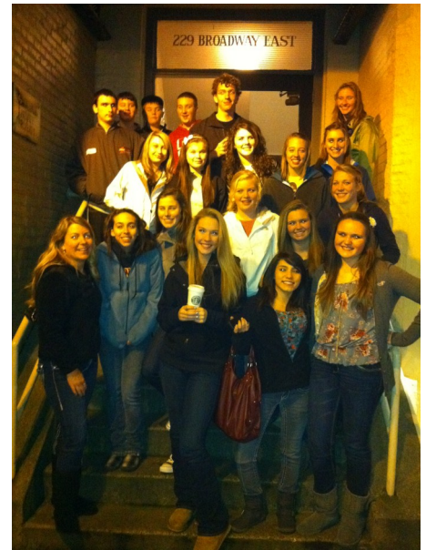
Senior High Youth in Seattle at the St Mark's Cathedral Compline Service in 2011.

Holden Retreat is May 19th—21st—more info will come later!!