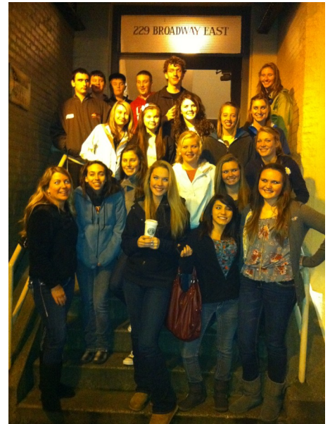
Senior High Youth in Seattle at the St Mark's Cathedral Compline Service in 2011.

Holden Retreat is May 19th—21st—more info will come later!!