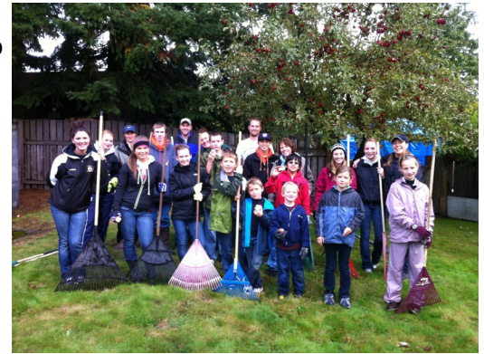
TLC youth making a difference on faith in action day!!

"My grace is sufficient for you, for my power is made perfect in weakness." 2Corinthians 12:9